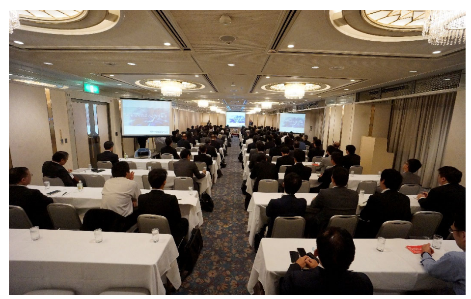
Special seminars and product and technology presentations by exhibitors are also held.

Thermal Technology 2019, the exhibition on industrial furnaces and equipment sponsored by the Japan Industrial Furnace Manufacturers Association, is going to be held in less than a month's time, starting from 17 – 18 October 2019 at the Knowledge Capital Convention Center, Osaka, Japan. Thermal Technology is the only show in Western Japan which covers the field of industrial furnaces and related technology, one of the key industries in the region. Entering its fourth edition, the show hosts 98 exhibitors from eight countries covering the latest products and technologies in the industry.